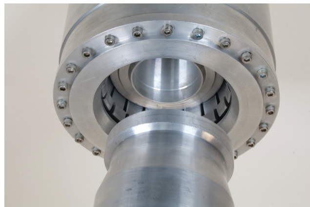
Connector Bottom View (Approaching)