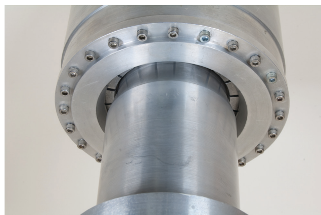
Connector Bottom View (Locked)